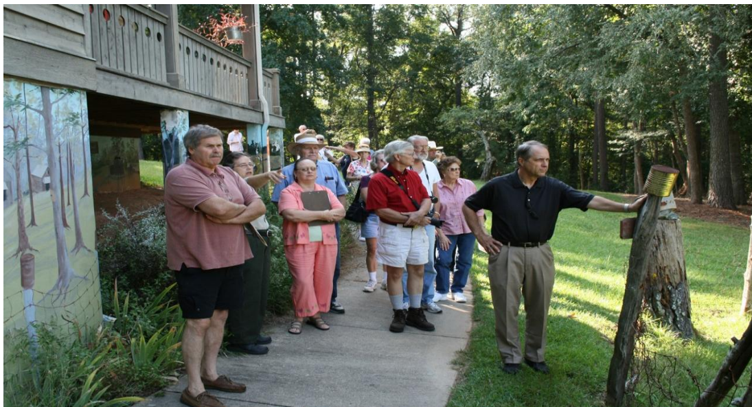
Picture taken at the Jarrell Plantation State Historic Site, Juliette, GA

The Middlebrooks Family Association Inc., 2010 Meeting/Reunion was September 8 – 11, in Macon, GA.